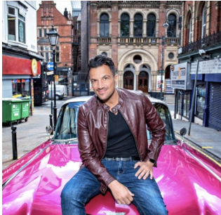
Above: Peter Andre as Teen Angel & Vince Fontaine

We have reserved 20 tickets for this show.